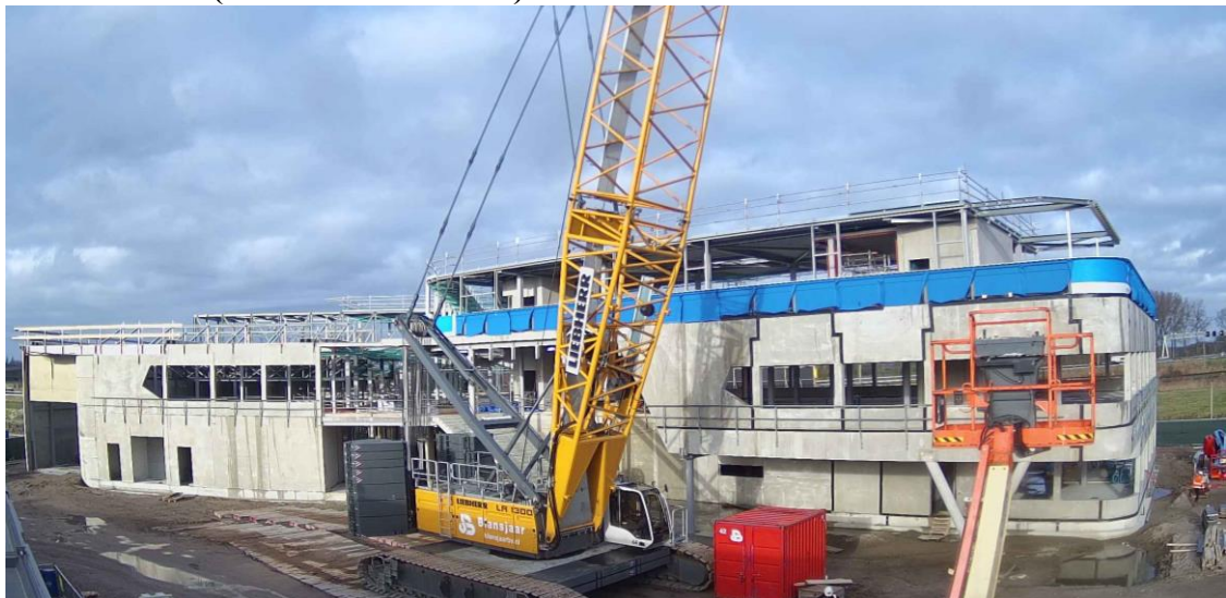
FIGURE 1: PLACEMENT OF THE STRUCTURE AND FACADE (28 JANUARY 2022)