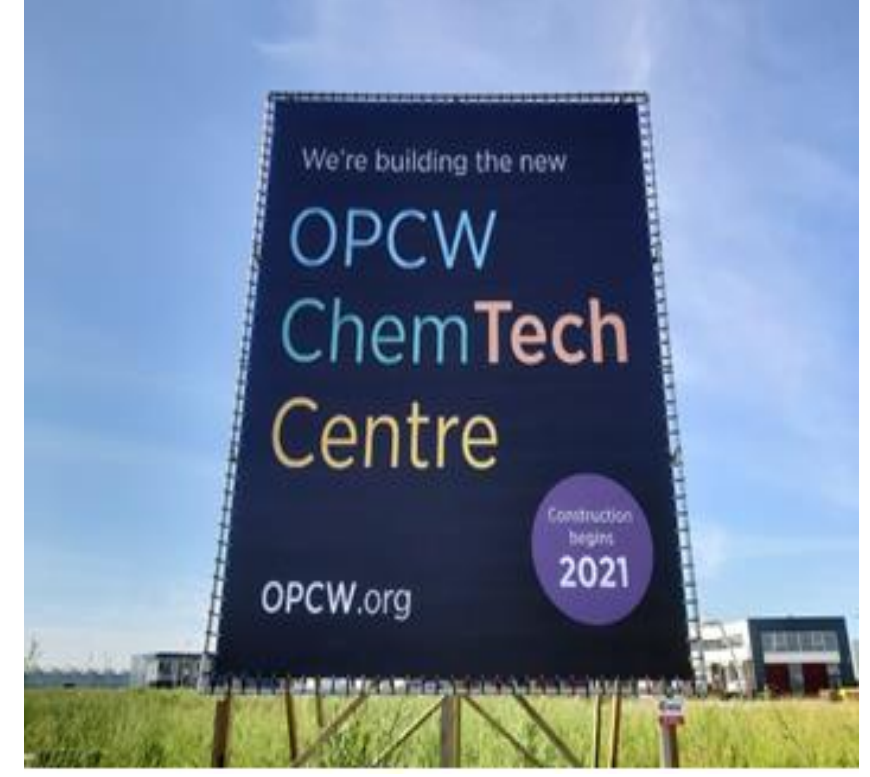
FIGURE 3: BILLBOARD ANNOUNCING THE ARRIVAL OF THE CHEMTECH CENTRE