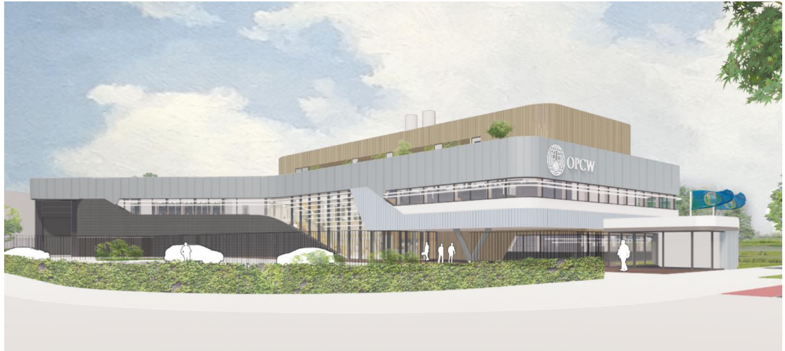
FIGURE 2: DESIGN RENDERING OF THE OPCW CENTRE FOR CHEMISTRY AND TECHNOLOGY