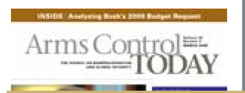
An Arms Control Today Reader