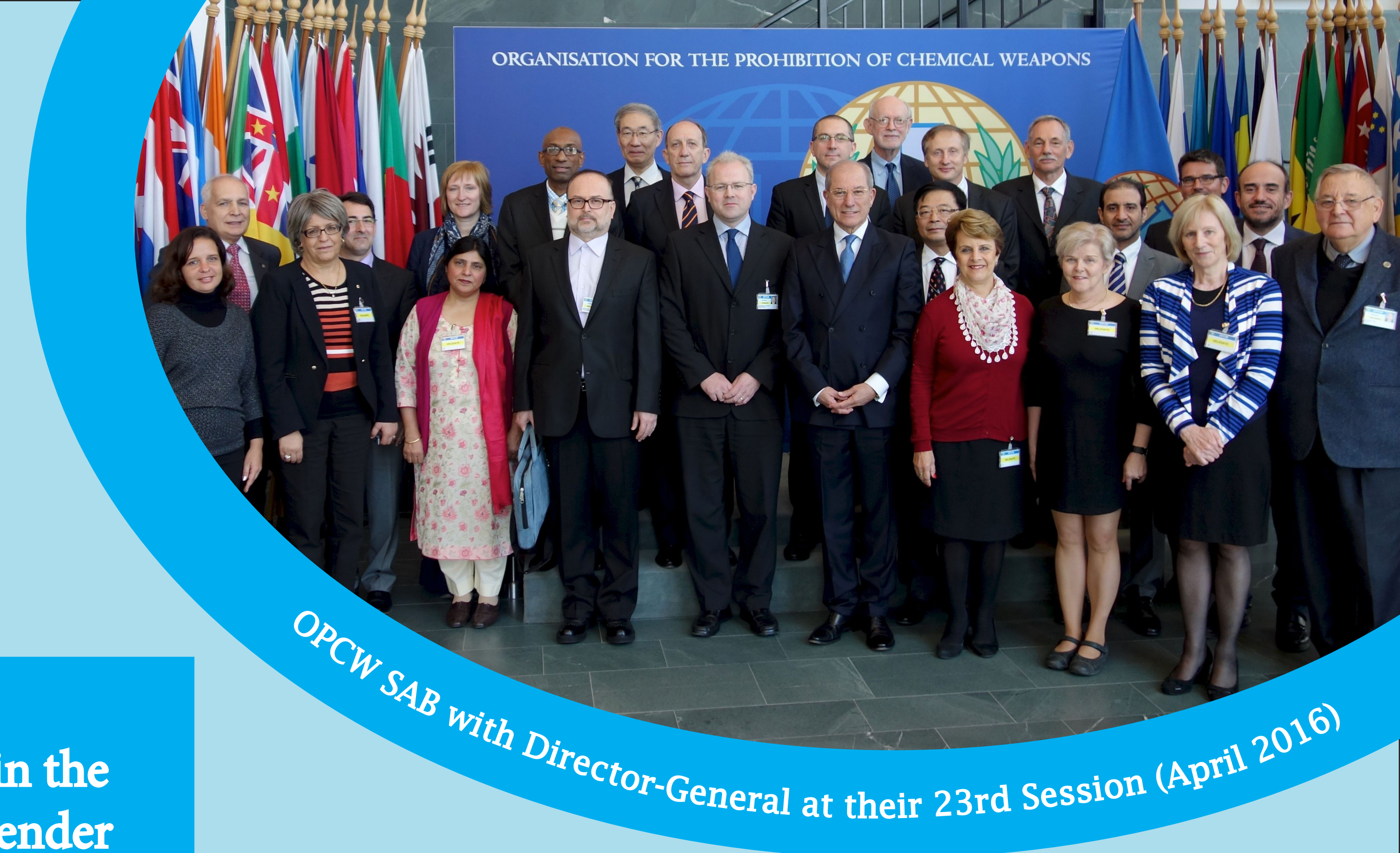
OPCW SAB with Director-General at their 23rd Session (April 2016)