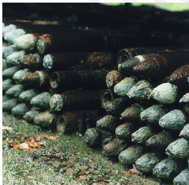
Old chemical munitions (Pierre Bogaert, SID, Belgium)

Also deserving of mention are toxins – toxic chemicals produced by living organisms. Although also considered to be biological weapons, toxins are addressed by the CWC. The development, production and stockpiling of toxins for purposes of warfare are prohibited under the Biological Weapons Convention (BWC). Parties to that treaty that possess toxin weapons agree to destroy them. However, inasmuch as toxins are chemicals themselves and can have chemical weapons applications, they are automatically covered by the definitions listed above for chemical weapons and toxic chemicals. (Two toxins, ricin and saxitoxin, are in fact explicitly listed in Schedule 1.) This is due to the fact that a large number