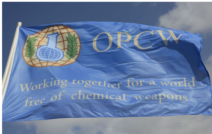
A flag with the logo and mission of the OPCW

The Advisory Body on Administrative and Financial Matters (ABAF) is a subsidiary body of the Executive Council established to provide advice on administrative and financial matters. As such, it does not have decision-making powers. Its role is to examine the draft annual programme and budget, internal oversight reports, audits and other budgetary proposals submitted by the Secretariat and to report its findings to the Council. The ABAF's members are experts of recognised standing in financial and administrative fields appointed by the members of the Executive Council.