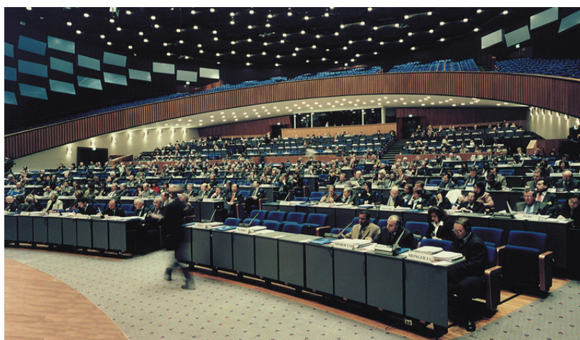
A session of the OPCW Conference of the States Parties

The Conference is composed of representatives of all Member States of the OPCW, each of which has one vote. It meets annually for one week in The Hague. Special sessions of the Conference can be convened under the following circumstances: when decided by the Conference itself, when requested by the Executive