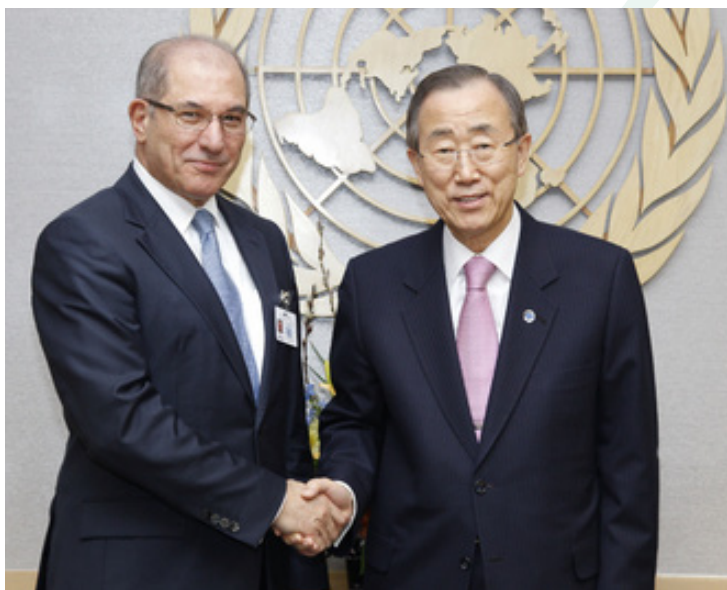
OPCW Director-General Ahmet Üzümcü and UN Secretary-General Ban Ki-moon. The Secretary-General is the CWC depositary.

Under Article X (Assistance and Protection against Chemical Weapons) , States Parties retain their right to develop and use protection against chemical weapons. States Parties commit to the fullest possible exchange of equipment, material and information concerning protection. In addition, each State Party is to make resources available to the OPCW for use in assisting States Parties attacked or threatened by attack with chemical weapons. This may be done in at least one