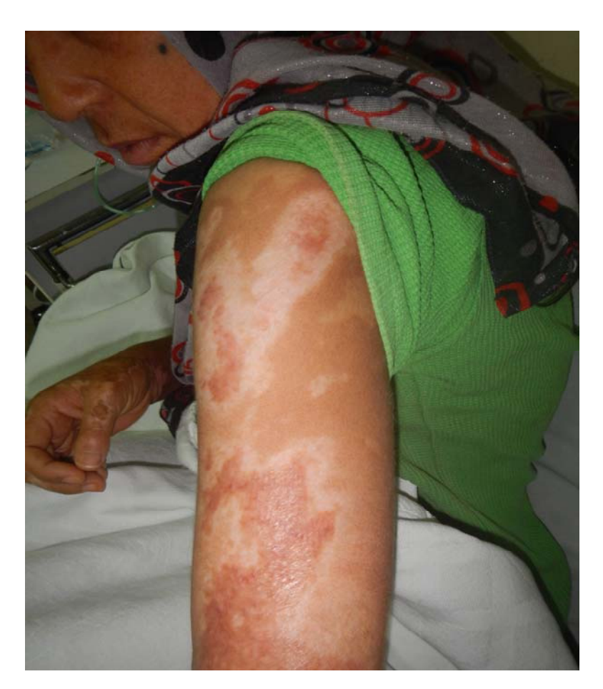
Picture 4. Photo of the upper arm of a female casualty taken by the FFM.