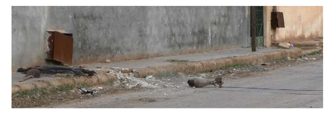
Picture 7. Removal of the reported unexploded projectile. A visual assessment indicates that this is the projectile that was recovered by the Russian Federation's CBRN team and handed over to the authorities of the Syrian Arab Republic.