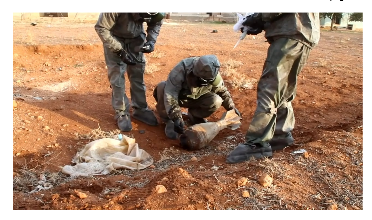
Picture 8. Sampling operations being conducted by the Russian Federation's CBRN team on the item that appears in Picture 7.