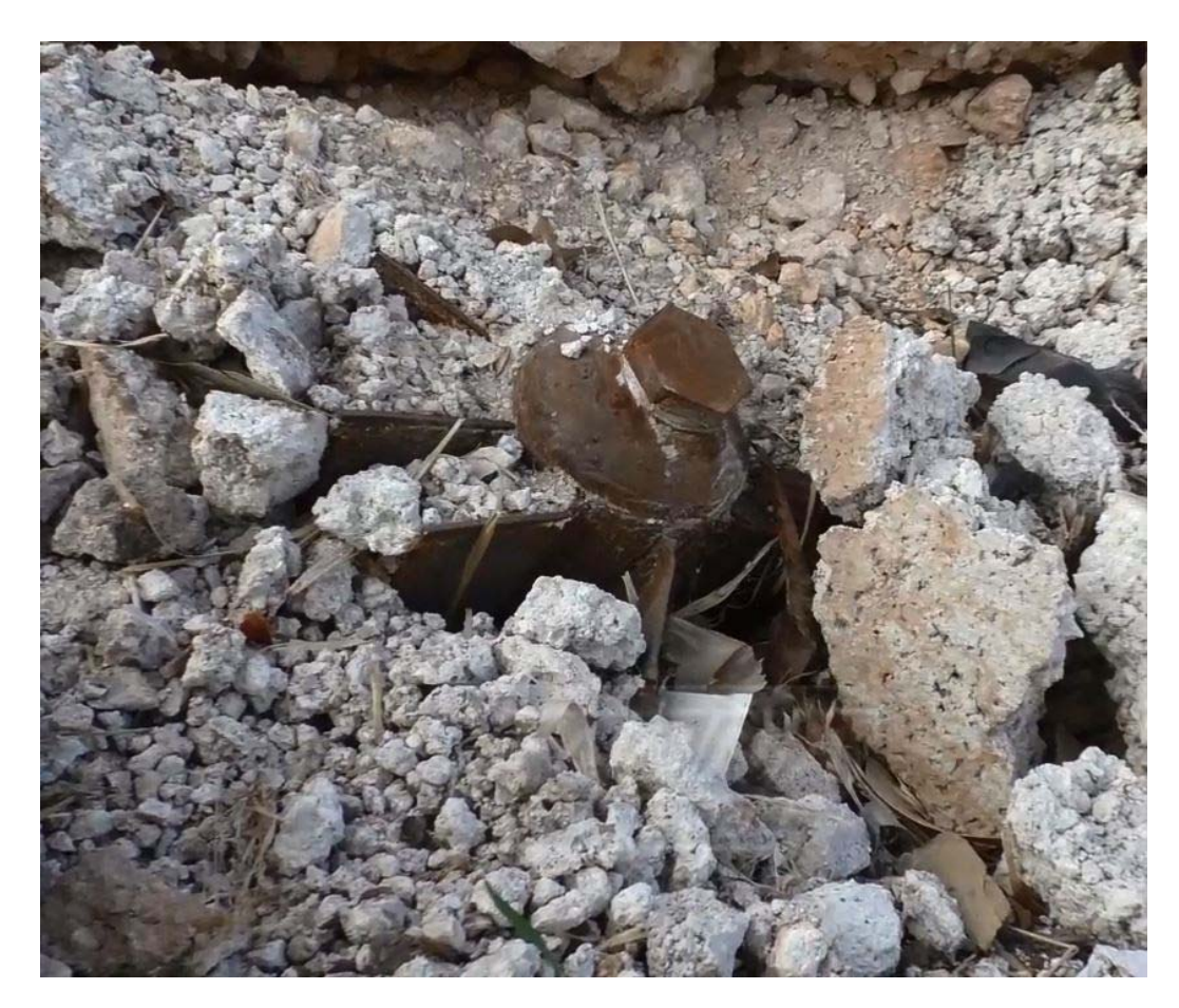
Picture 6. Photo of the tail boom of the reported unexploded projectile prior to extraction from the ground (provided by the authorities of the Syrian Arab Republic).