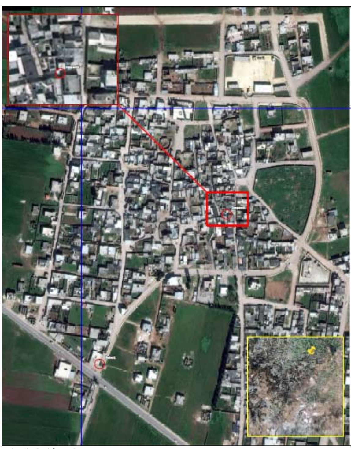
Map 1. Incident site.