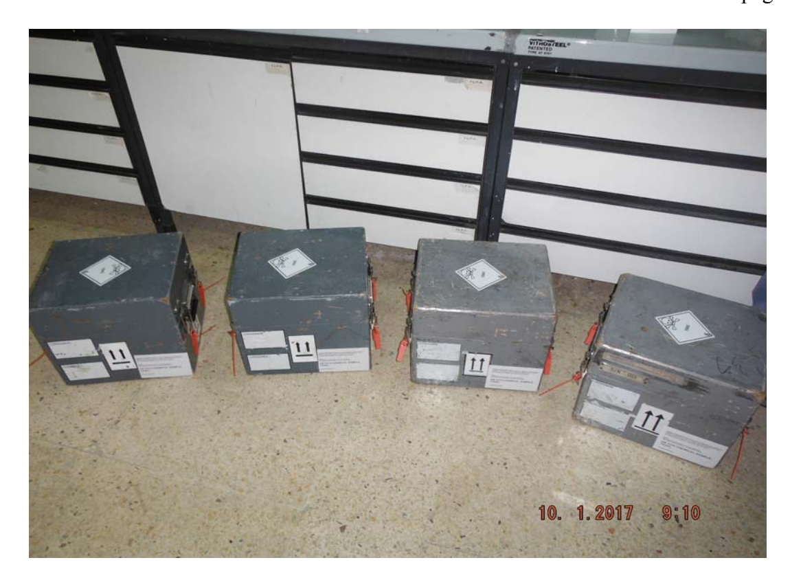
Samples and items in joint custody in SSRC in Barzi