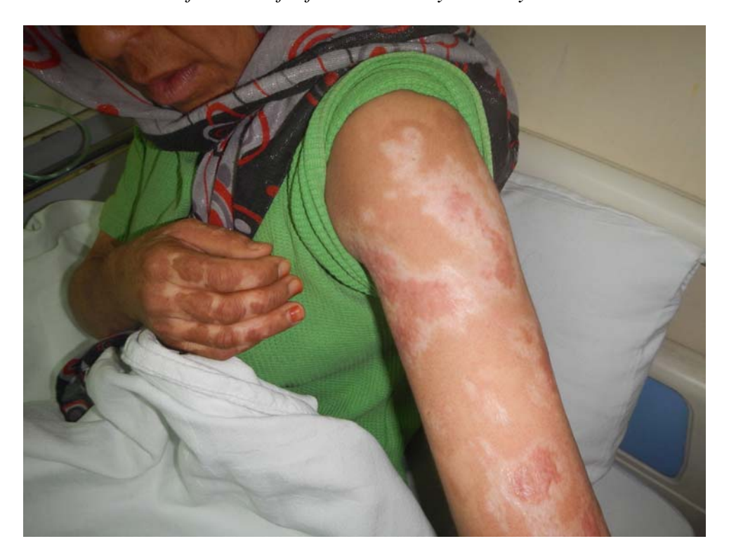
Picture 3. Photo of the upper arm of a female casualty taken by the FFM.