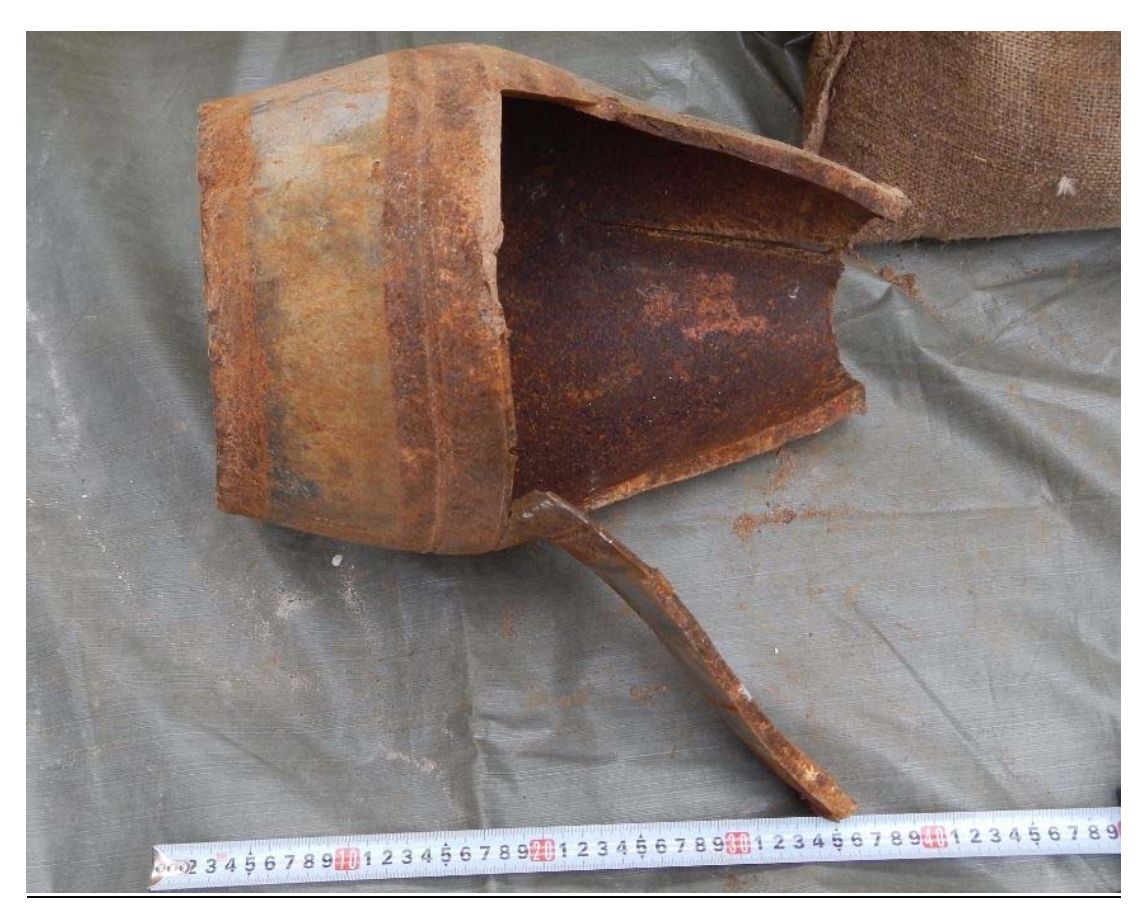
Picture 11. Fragment of the mortar described in paragraphs 5.19 and 5.35.

5.35 During the technical exploitation, a physical examination was conducted on a munition fragment collected by the Technical Committee; the fragment appears to be similar in structure to the unexploded mortar. It is assessed that this is the fragment found in the video described in paragraph 5.19. There was no indication that a chemical warfare agent was present.