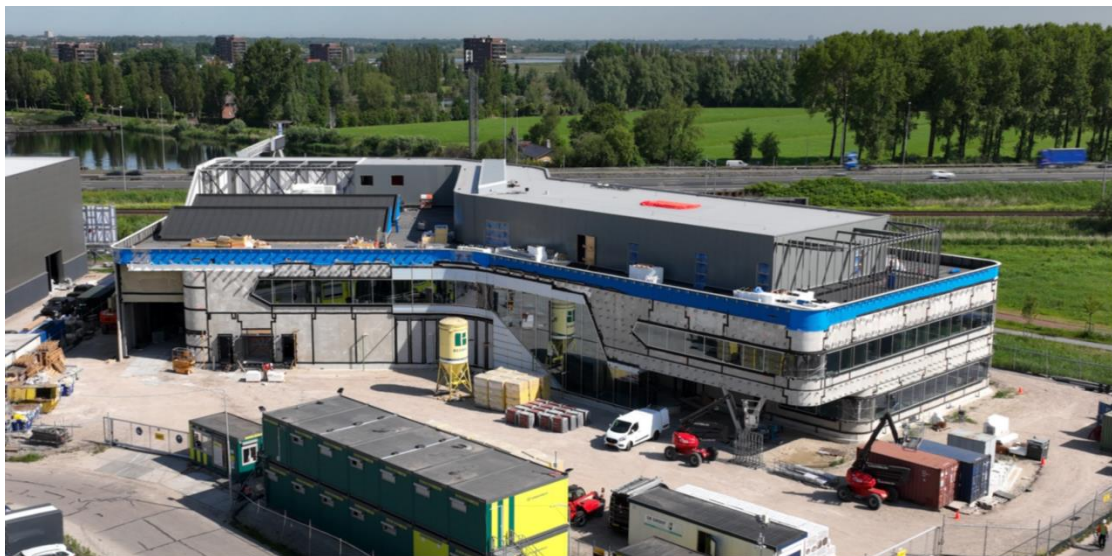
FIGURE 1: PLACEMENT OF THE FACADE (MAY 2022)